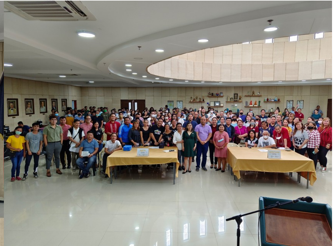
Presentation of the Geopark Project and 4GEON Project to the Bohol Arts Culture and Heritage Council during their General Assembly on 27 January 2023