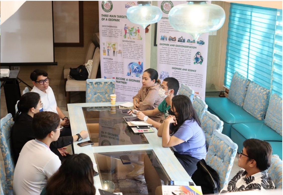
Focus group meeting with the Philippine National Commission for UNESCO and selected Boholano youth leaders on 23 November 2022