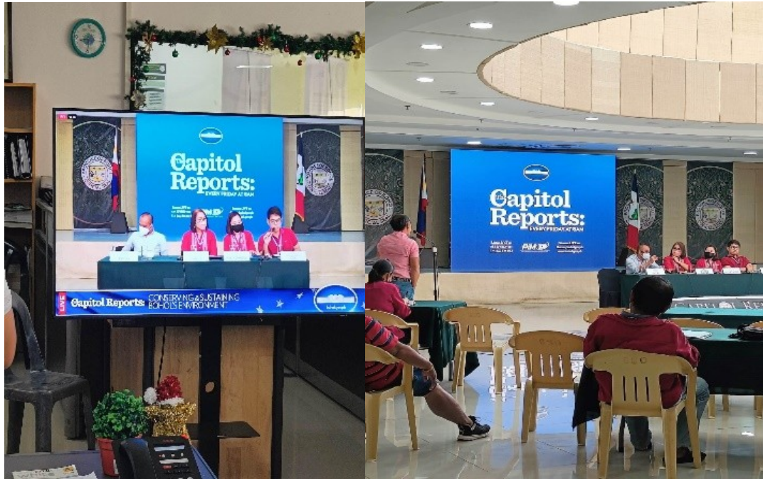
The Capitol Reports (25 November 2022)