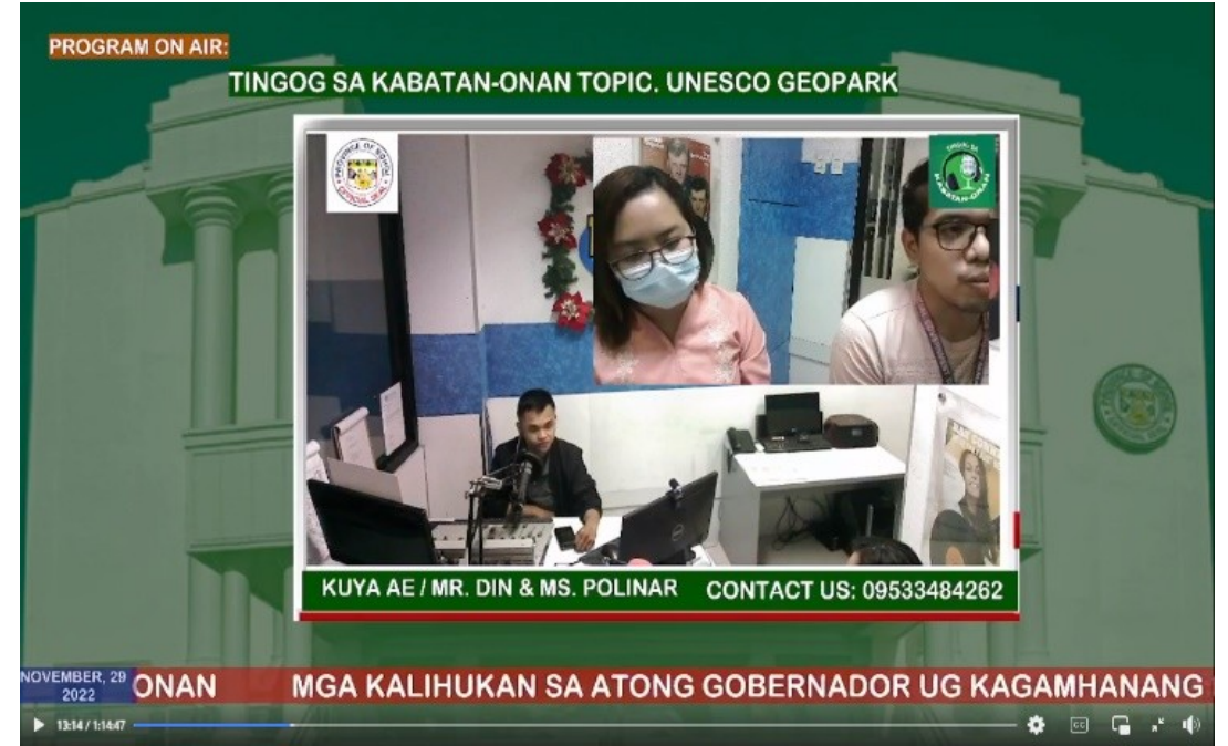
Guesting in a radio program Tingog sa Kabatan-onan (The Voice of the Youth) (29 November 2022)